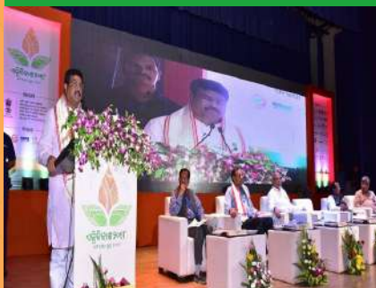
Validictory: AgriVikas18, Odisha