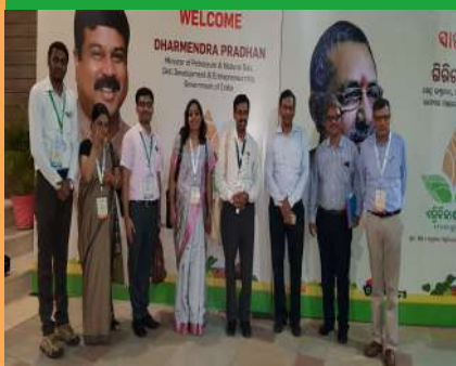
NIAM Team at AgriVikas with Joint Secretary (Marketing) DAC&FW, GOI