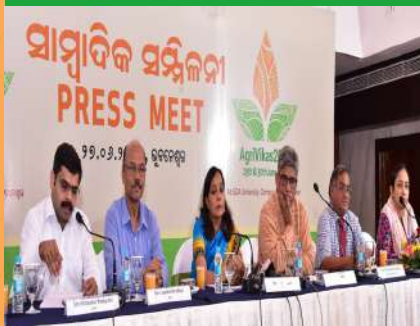
The Press Conference was held on 27th June 2018, at, Bhubaneswar to address the Media and Inform the objectives and Plan of Agrivikas 2018

AgriVikas 2018 was organized in Bhubaneswar on 29th-30th June, 2018 to showcase the potential of the Agriculture & allied sectors in Odisha. The event was supported by the CCS National Institute of Agriculture Marketing (NIAM)(Knowledge Partner), KPMG, Centre for Youth and Social Development (CYSD), Siddha Development Research Consultancy (SDRC) and Sahabhagi Vikash Abhiyan (SVA) as partners and was hosted by Shiksha 'O' Anusandhan (SoA).