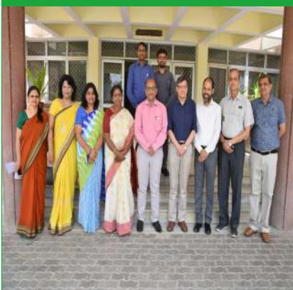
Experts in a workshop of Review and Revision of Courses for PGDM (ABM)