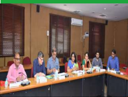
Internal faculty Experts in a workshop of Review and Revision of Courses for PGDM (ABM)